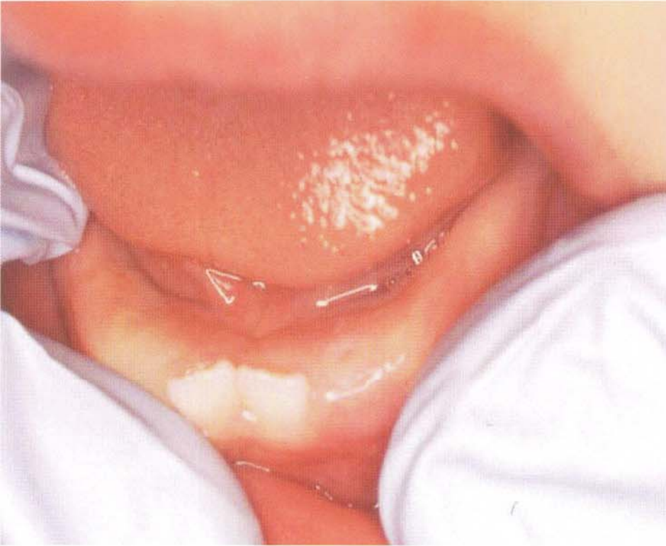
First primary teeth: usually lower central incisors around 6 months