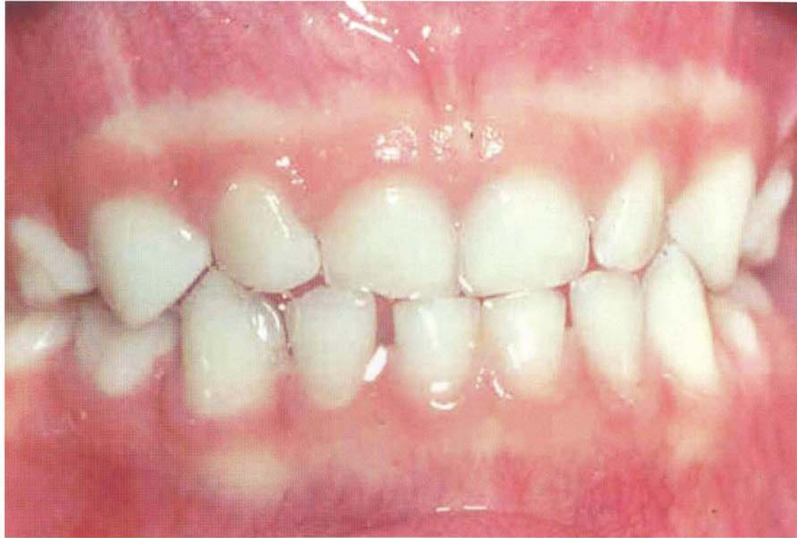
All 20 primary teeth by 3 years