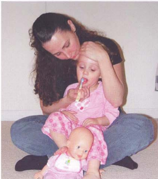
Stabilize child's head