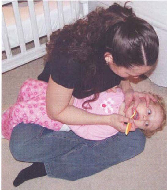
Child's head in your lap