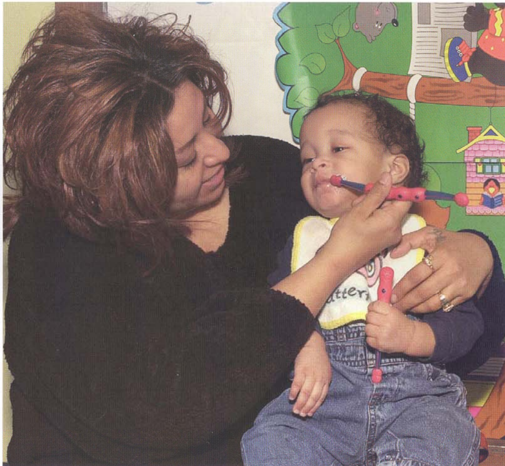
Brush your child's teeth until age 7